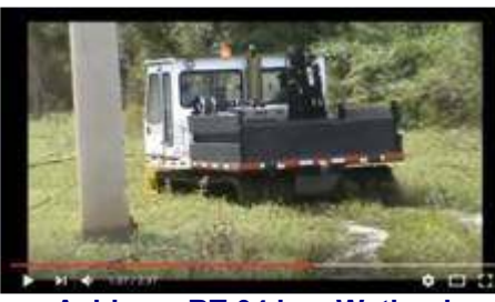
Achiever RT 04 in a Wetland