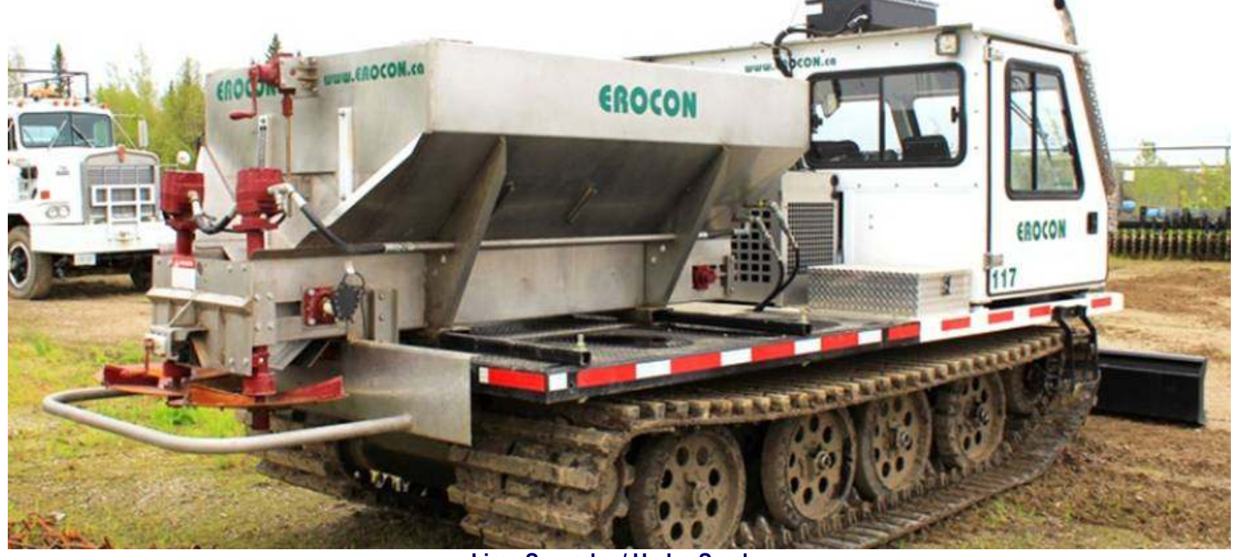
Lime Spreader / Hydro Seeder

UTV International <a href="http://www.utvint.com">http://www.utvint.com</a>