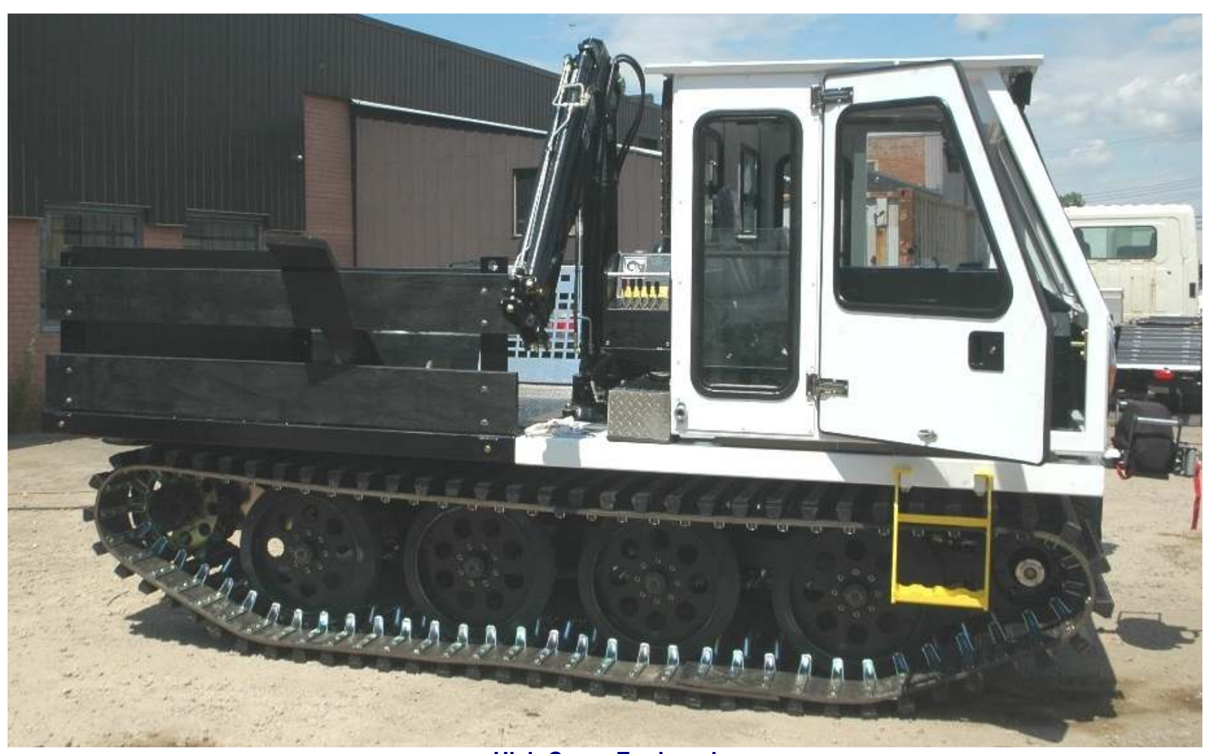
Hiab Crane Equipped