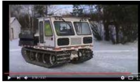
29" Rubber Tracks in Snow