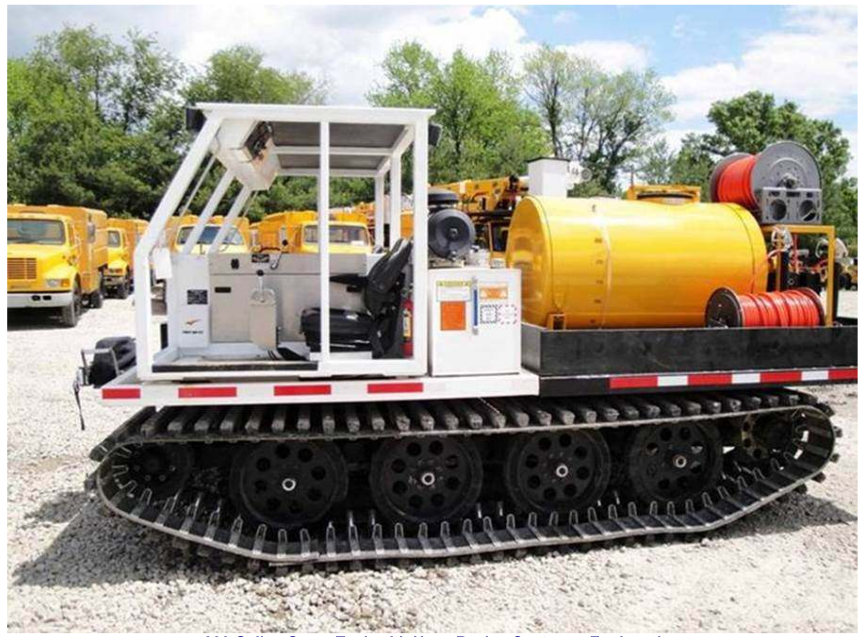
300 Gallon Spray Tank with Hose Reels - Customer Equipped