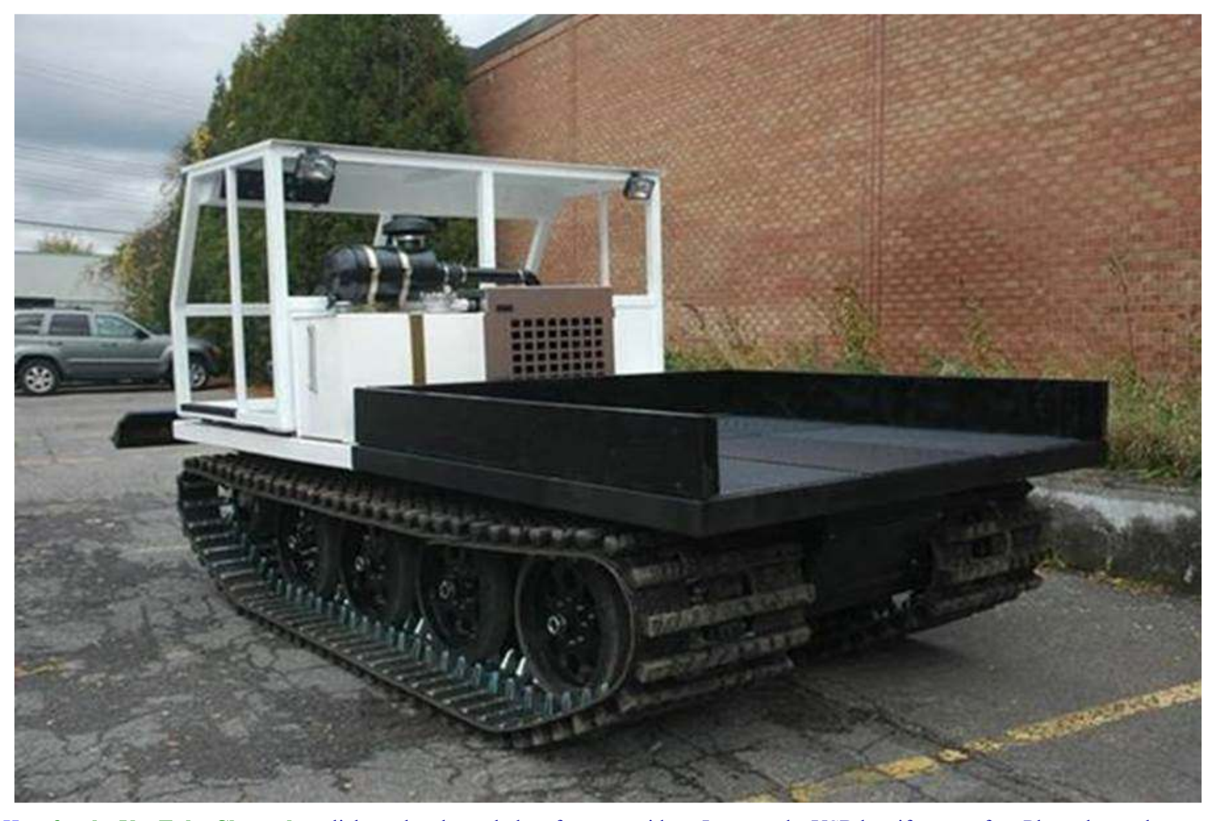
Click Here for the YouTube Channel or click on the photos below for some video. I can send a USB key if you prefer. Please let me know.